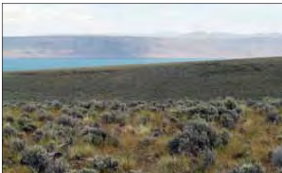
Healthy sagebrush steppe habitat.