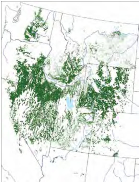
The sagebrush region of the Intermountain West.